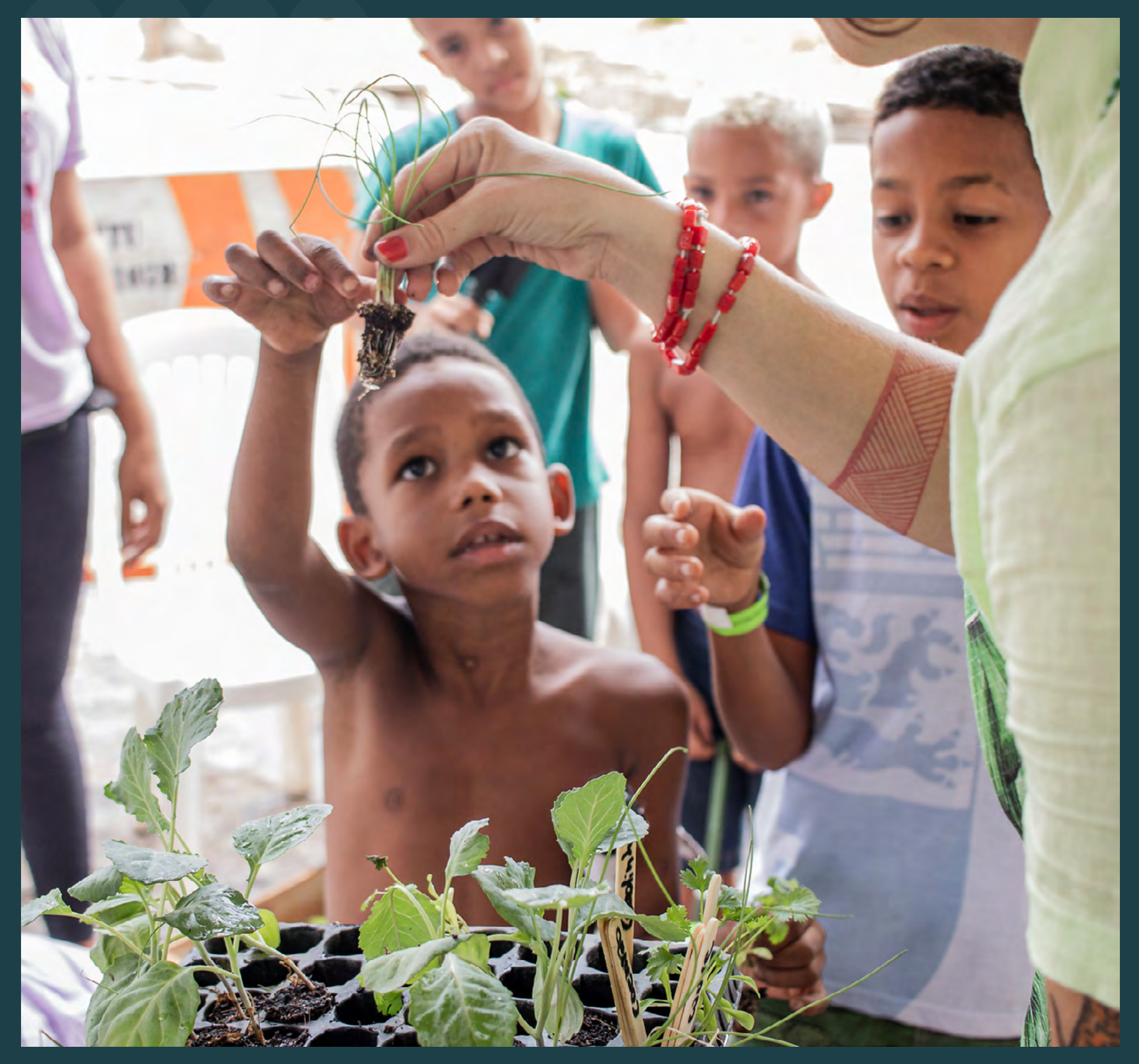
Organic vegetable gardens workshop in Comunidade do Pilar, December 2023.