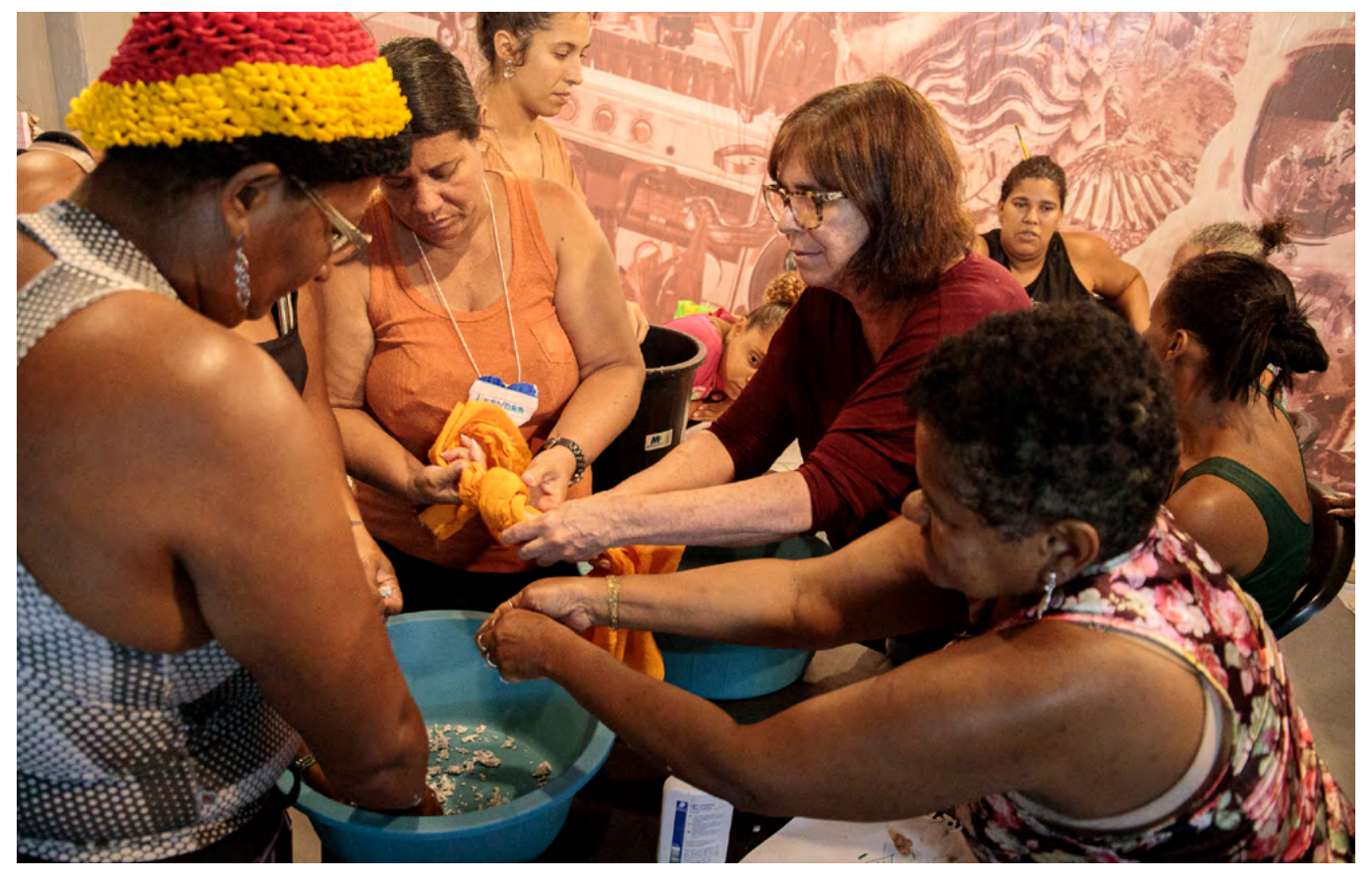
Community handicrafts training (360° handicrafts project), October 2023.

The WG Waste Management aims at improving community health, reducing emissions from unsustainable waste treatment, and creating employment and income opportunities related to waste management. Among the initiatives of the group are awareness-raising activities about waste separation and destination, various efforts to install adequate infrastructure for waste collection, and work with local waste pickers to organize a cooperative and foster more sustainable practices. Exchanges between Comunidade do Pilar and existing waste pickers' associations are encouraged by the UL. More sustainable waste management is also being supported by the municipal government through the roll-out of a pilot project using electric tricycles for waste collection in the neighbourhood.